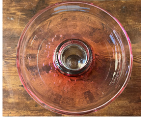
Alana Lake, The Offering , 2022. Hand blown glass, 30 x 30 x 30 cm (in collaboration with Francesco Langer) 1300 €