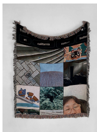
Kevin Kao, Three Twenty One , 2022, Jacquard blanket, 127x152.5 cm. 460 €