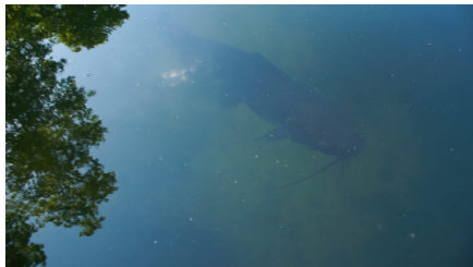
Rachel Lin Weaver, Slough , 2022, Video, single channel projection, silent, looped. 1920x1080p HD. Edition of 5. €1405