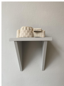
Suzanne Dittenber, Polymer I , 2022, cast porcelain, 430€