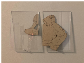
Makeda Lewis, it always costed me more every time I tried to make someone else pay 2022, 112x160cm. 275 €