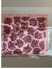
Brooks Harris Stevens, Under the Guise of Destruction , 2022, tufted wool, cotton and acrylic yarn with video projection, NFS