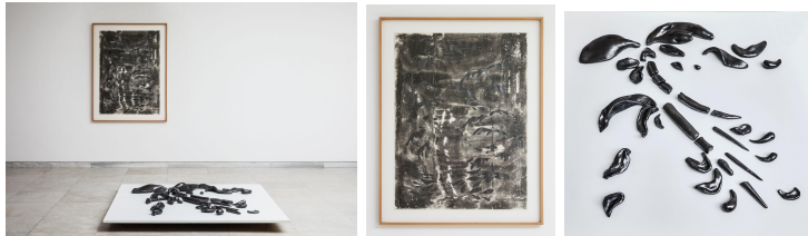
Despina Flessa, How things emerge from the grounds , installation graphite on clay, 30 x 130 cm, 2021, 5.000 €