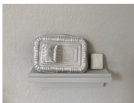
Suzanne Dittenber, Polymer III 2022, cast porcelain, 275€