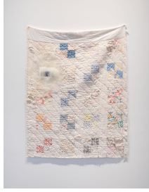
Rachel de Cuba, Soft Spot , 2019, Antique quilt remnants, wool, found photographs, ink About 76x101.5 in. & 76x71 cm. 550 € each