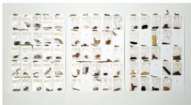
Hirona Matsuda, Family Tree , 2022, tape remnant and string sculpture, archival print. Sculpture: 1285 €, print triptych: 230 €