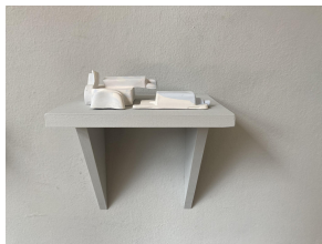
Suzanne Dittenber, Polymer II , 2022, cast porcelain, 415€