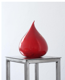
Alana Lake, Blood drop , 202, Hand blown glass on metal plinth, 34 x 32 x 39 cm 1300 € Blood drop , 2021, Hand blown glass, 32 x 33 x 41 cm 1100 € Blood drop , 2021, Hand blown glass, 32 x 33 x 45 cm 1200 € *Or complete install (3 blood drops and 1 canvas) for 3500 €