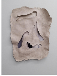
Kathrin Köster, o.T. 2022, sculpture of paper and fotografie, 80x65cm, 900 €