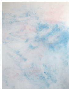
Alana Lake, Lost Lover's (installation) , 2022, Acrylic on canvas 400 €