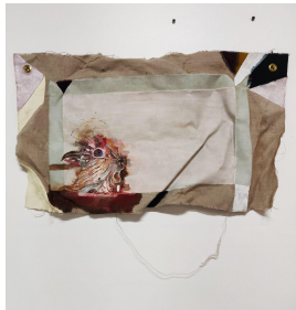
Luke Whitlatch, Let sleeping Dogs Lie , 2022, oil acrylic and dye on unstretched linen, 67x 46 cm. 2935 €