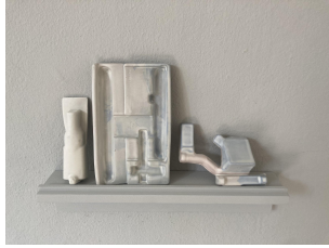
Suzanne Dittenber, Polymer IV , 2022, cast porcelain, 275€