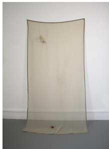
Lindsay Smith Gustave, Offering , 2022, chiffon, velvet, glass beads, thread, plaster, map pins, 183x91.5 cm., 1100 €